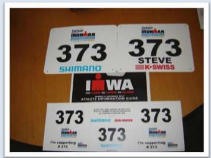
Lining up all race bibs in preparation for the race

At one point of the night Mike Reilly, the voice of Ironman, asked for all fort time Ironman athletes to stand up... Naomi and I were the first timers from the Lakers. It felt weird to be cheered and clapped by all the other athletes and created some nervous energy/excitement.