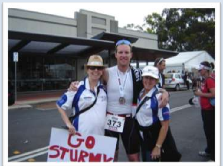
The Sturm Support Crew

"Swim 2.4 miles! Bike 112 miles! Run 26.2 miles! Brag for the rest of your life"