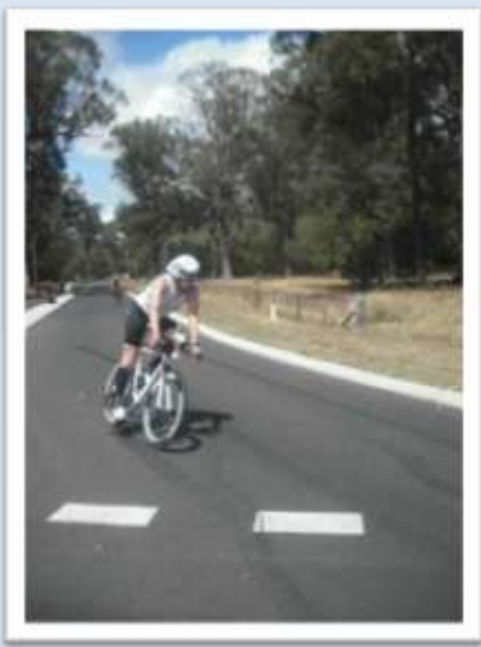
Tight concerning on the bike

I managed to see some of my training buddies on this lap and that provided me with the extra motivation I needed.