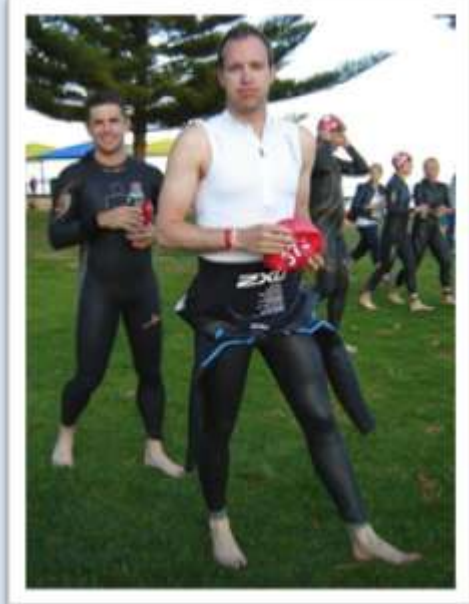
Time to race – lining up before the swim