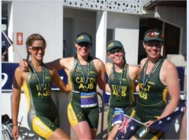
Lakers Social Team

Thanks all of those that attended also – it was a great day.