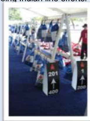
All bags lined up at Transition

The first lap went by pretty quick... 55 minutes. There were so many other people running, like doing Indian line efforts.